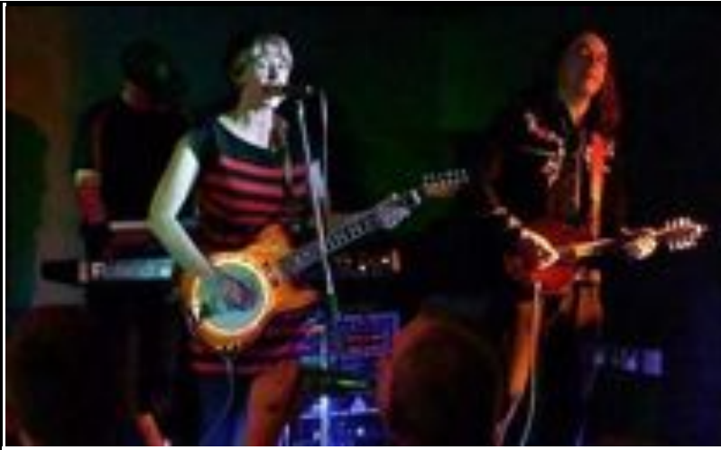
The Banjitar at The Zoo Bar